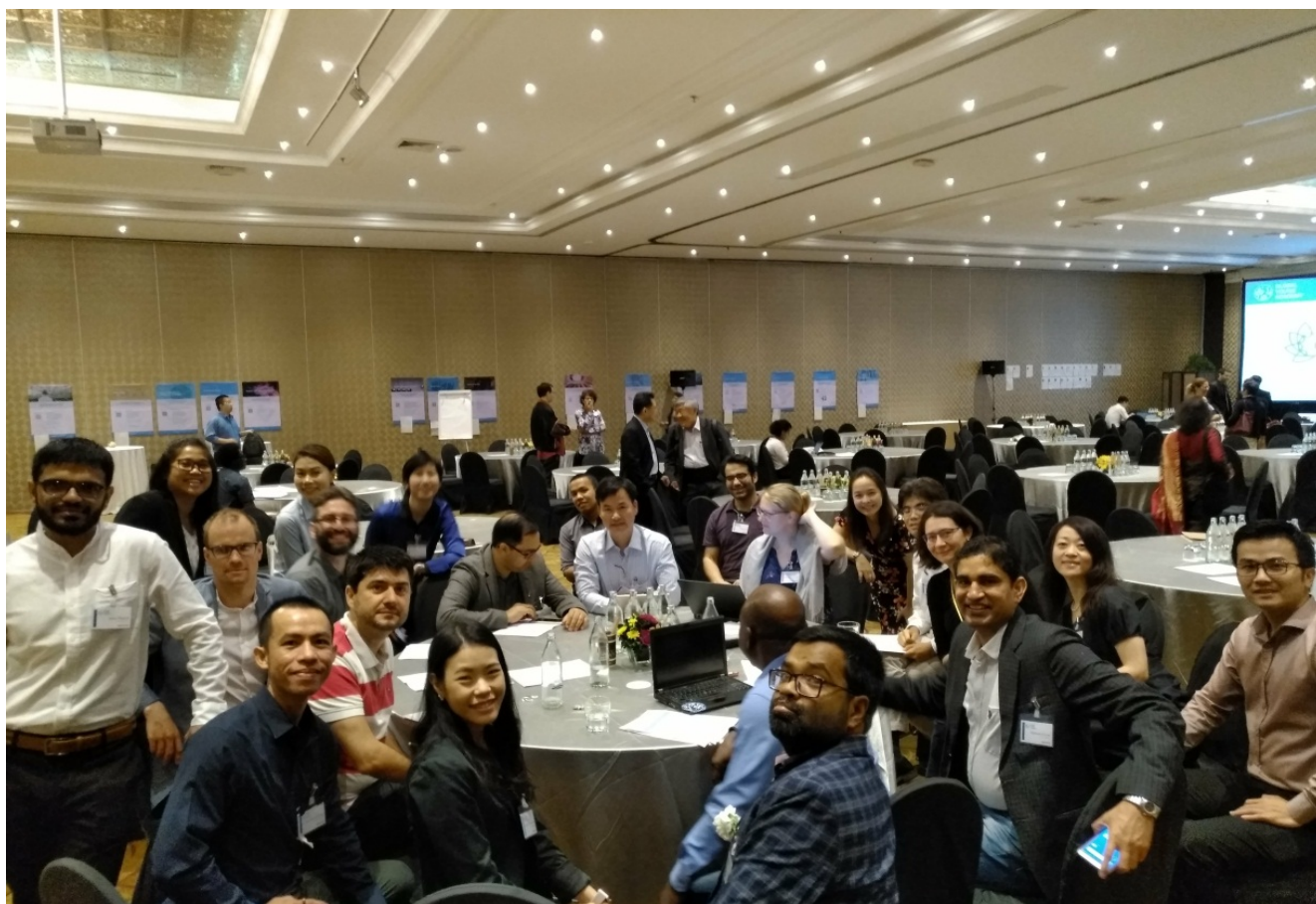
Representatives of NYAs at the meeting of National Young Academies on 9 May 2018 in Pattaya, Thailand.