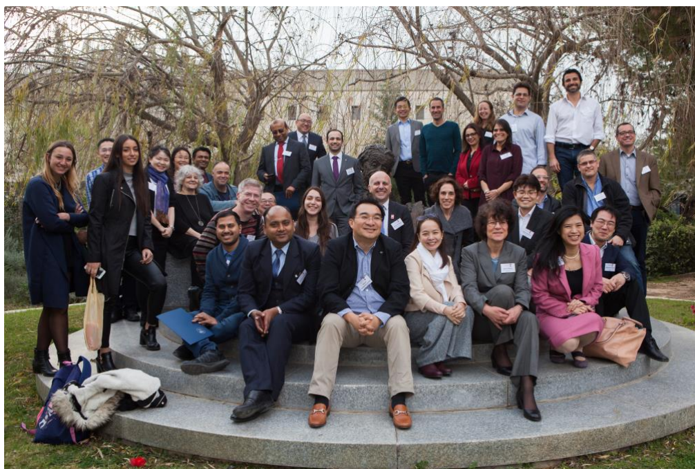
Photo 2. Asian Young Academies' representatives and Prof. Ada Yonath, the 2009 Chemistry Nobel Laureate, at the statue of Albert Einstein.

The theme of the meeting was: “Science and Society: Challenges and Prospects”. Forty researchers from both the GYA and members of national young academies in the region participated. See here for more information: https://globalyoungacademy.net/meeting-of-asian-young-academies/